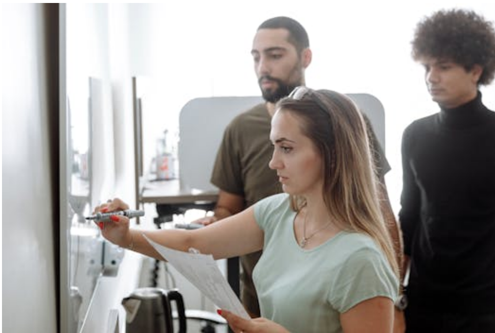
A successful onboarding session in progress.

An effective onboarding process is vital for the success of both new employees and the company. By implementing structured programs, Great Pasta not only enhances employee satisfaction but also strengthens its workforce. Investing in onboarding ultimately leads to a more skilled and loyal employee base.